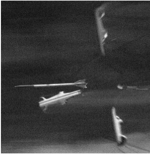
10m (approx.) from muzzle

The images below show sabot separation and APFSDS projectiles approximately 10m and 45m downrange of the muzzle. The top images show correct separation when using propellant at a lower temperature. The second pair of images show asymmetric sabot separation and projectile break up at 10m and the remaining part (tip behind remains of body) yawing significantly at 45m downrange.